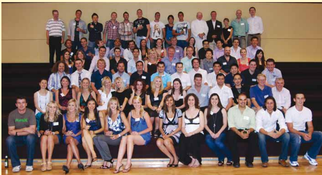
The Class of 1999.